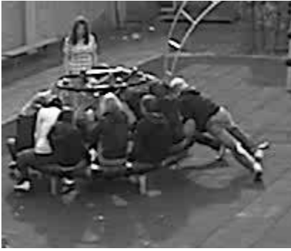
Figure 2: A group of young teenagers spin

Observation of analog play: A group of about ten young teenagers gradually invades the supernova (see Figure 2). The teenagers are relaxing in shifts. Once in a while one or two rises and make the Supernova spin. At one time the spinning is so fast that one falls of. The pace of the play and informal being together pulsates. Some of the teenagers are more active than others. This group did not use the digital console at any time.