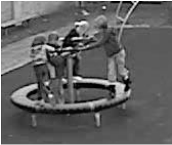
Figure 3: Digital play at the Supernova

The next example is a younger group of children that uses the supernovas digital possibilities: