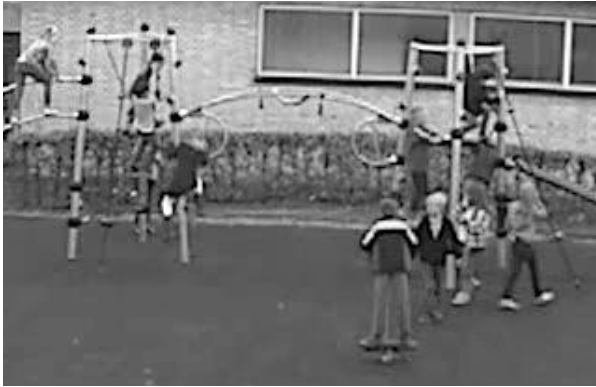
Figure 4: Climbing rack in action

Observation of digital play: At first the child rocks the seesaw energetically. This activates the console. Then three to five children runs and climbs in order to press the light buttons. Some of the children have placed themselves at opportune spots in the climbing rack. The children pushes the buttons in a fast pace. There are also children in the rack who does not participate. Analysis: This situation shows the connoisseur's way of using the digital rack, the play leader activates the console and the rest of the gang was divided into appropriate positions around in the rack. The youngest children were more exploring in the way of using the console. The older children were more focused, and it was easy to see a clear role distribution, and they collaborated in order optimize their digital activity. The digital layer created physical play and social collaboration.