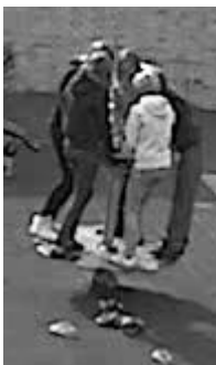
Figure 5: Five girls in deep play

Below is a description of digital and analog use of the rocking top called Rock-it see Figure 5.